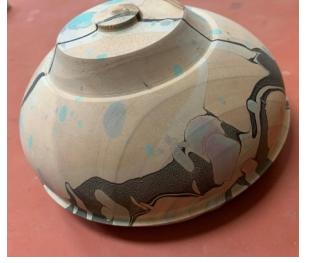
Marble finish experiment