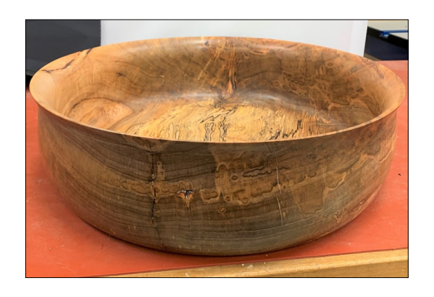
Reese Haren; Natural Edge Winged Bowl