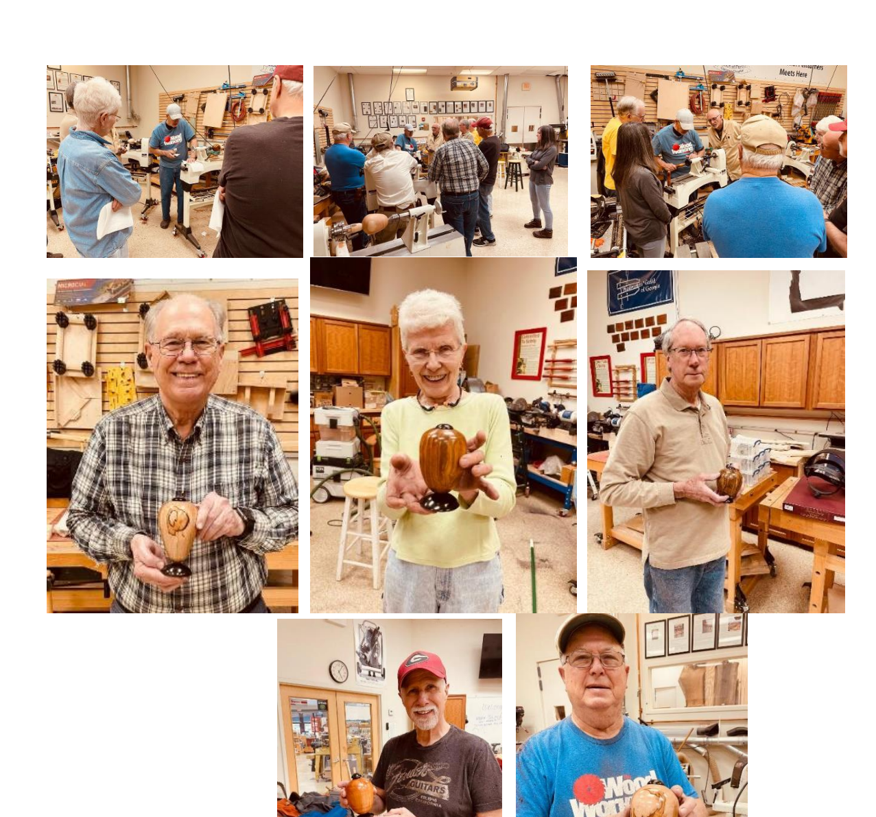
We had 11 members take the classes and it was a great learning experience as well as great fellowship.

Future HOT Sessions are booked from May through August on the first Wednesday of each month: 5/4; 6/1; 7/6; 8/3.